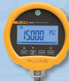
700G Series Precision Pressure Test Gauges