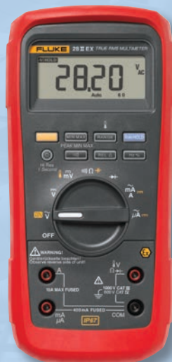
Fluke 28II Ex True-rms Industrial Multimeter