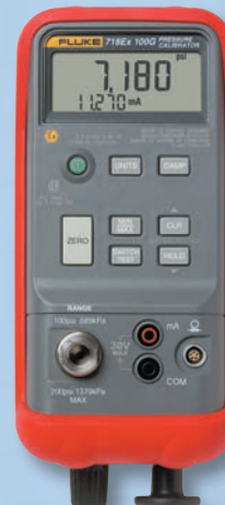
Fluke 718Ex Pressure Calibrator