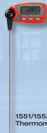
1551/1552 "Stik" Thermometers