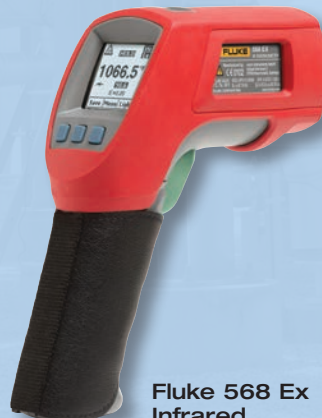
Fluke 568 Ex Infrared Thermometer