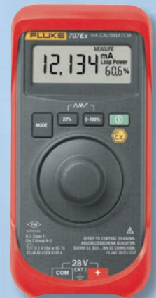
Fluke 707Ex Loop Calibrator