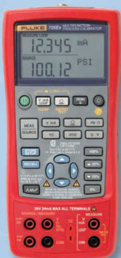
Fluke 725Ex Multifunction Process Calibrator

Fluke offers the widest range of reliable, accurate and intrinsically safe test tools. Including true-rms multimeters, infrared thermometers, process calibrators, pressure calibrators, loop calibrators and precision pressure test gauges.